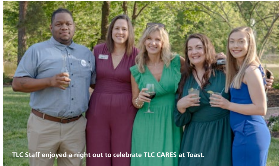
TLC Staff enjoyed a night out to celebrate TLC CARES at Toast.